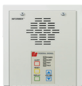
A flush mount kit is included for recessed applications as shown.