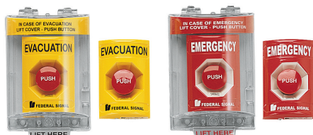
External push button activation