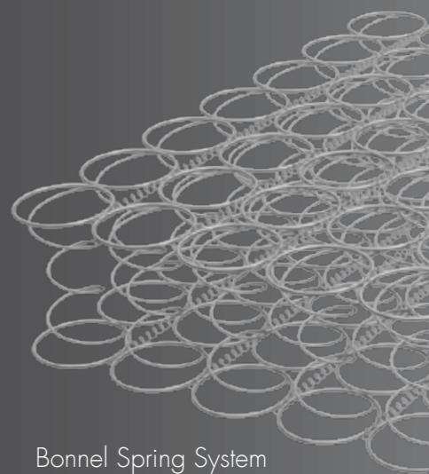
Bonnel Spring System

Springs are hourglass-shaped and the ends of the wire are knotted or wrapped around the top and bottom circular portion of the coil and self-tied.