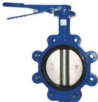
V905 Butterfly valve

Ductile iron butterfly valve. Fully lugged, to BS EN 593:2004, face to face dimensions to BS EN 558:2008