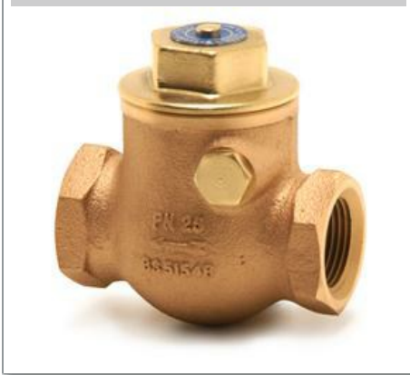
1060A Check valve

Bronze swing type check valve BS5154 PN25 Series B, metal disk