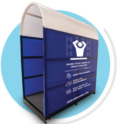
DISINFECTION SANITIZING TUNNEL FOR SINGLE PERSON ENTRY WITH ARCH DESIGN