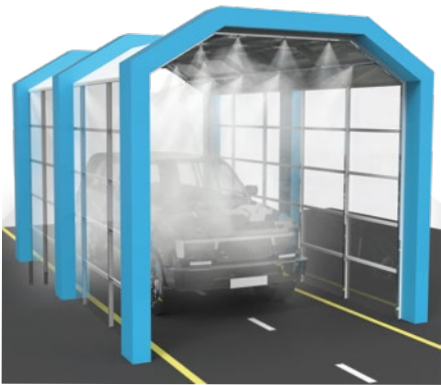
DISINFECTION SANITIZING LONG TUNNEL FOR COMMERCIAL VEHICLES & TRUCKS