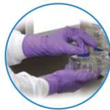
DISPOSABLE EXAMINATION NITRILE GLOVES