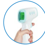
NON-CONTACT IR THERMOMETER