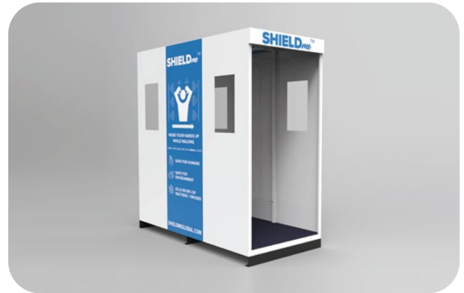
TUNNEL WITHOUT DOOR MODEL: DT-MF-100-W

SHIELDme™ disinfection tunnels are designed to achieve the following: