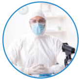
DISPOSABLE PROTECTIVE SUIT