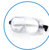
PROTECTING GOGGLE / EYE MASK