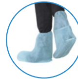
DISPOSABLE ANTI-SKID BOOT & SHOE COVER