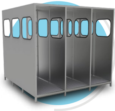
DISINFECTION SANITIZING TUNNEL FOR 3 PERSON ENTRY

Color Options: Blue Green White Red Yellow Orange