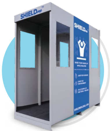
DISINFECTION SANITIZING TUNNEL FOR SINGLE ENTRY