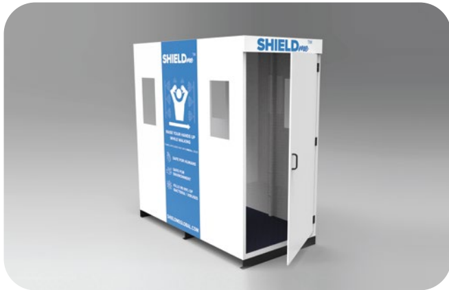
TUNNEL WITH DOOR MODEL: DT-MF-100-WD