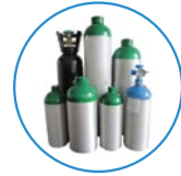
MEDICAL ALUMINUM CYLINDERS