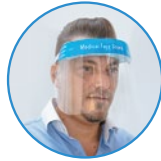
MEDICAL FACE SHIELD