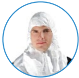
DISPOSABLE BOUFFANT HOOD