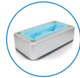
AUTOMATIC SHOE COVER DISPENSER