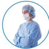
DISPOSABLE ISOLATION GOWN