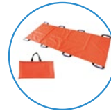
CARRY SHEET STRETCHER