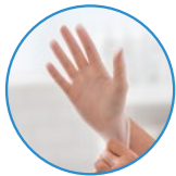
DISPOSABLE VINYL GLOVES