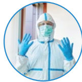
REUSABLE PROTECTIVE SUIT