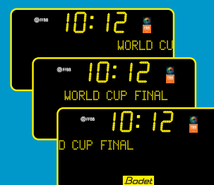
Example of scrolling message