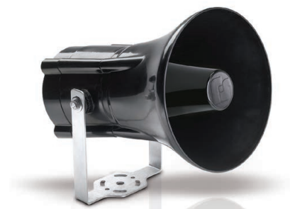
Shown with optional swivel mounting bracket